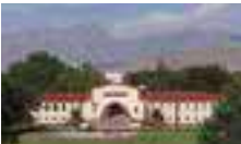
New Mexico State University