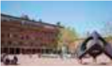
Western Washington University

These universities grant academic credit to students enrolled at them and can also grant transfer academic credit to students from other colleges who apply to the KCP program through them.