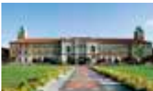
Texas Tech University