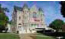
Virginia Union University