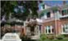
Idaho State University