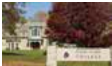
Rhode Island College