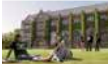
University of Idaho