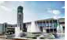
Missouri State University