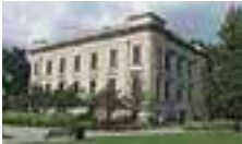
Indiana State University