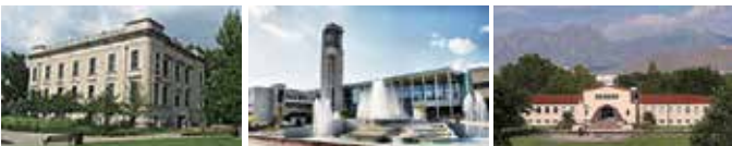
Indiana State University