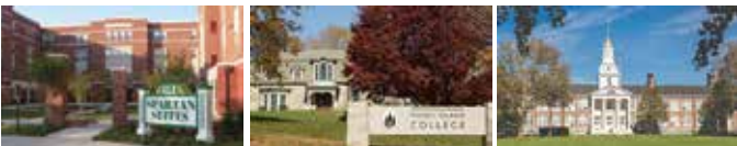
Norfolk State University