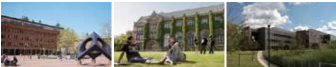
Western Washington University

These universities grant academic credit to students enrolled at them and can also grant transfer academic credit to students from other colleges who apply to the KCP program through them.