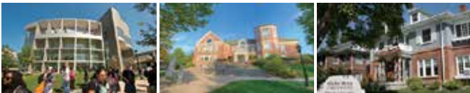
Cleveland State University

These universities grant academic credit to students who are enrolled at them.