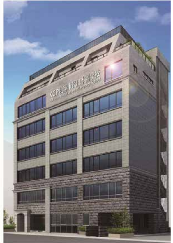
KCP Campus in the heart of Tokyo