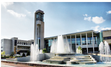
Missouri State University