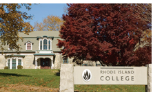
Rhode Island College