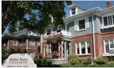
Idaho State University