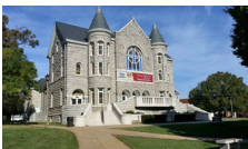
Virginia Union University