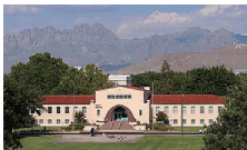
New Mexico State University