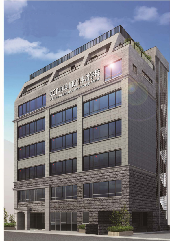
KCP Campus in the heart of Tokyo