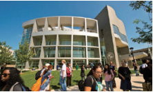
Cleveland State University

These universities grant academic credit to students who are enrolled at them.