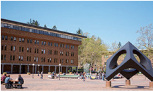
Western Washington University

These universities grant academic credit to students enrolled at them and can also grant transfer academic credit to students from other colleges who apply to the KCP program through them.