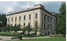
Indiana State University