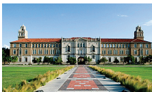
Texas Tech University